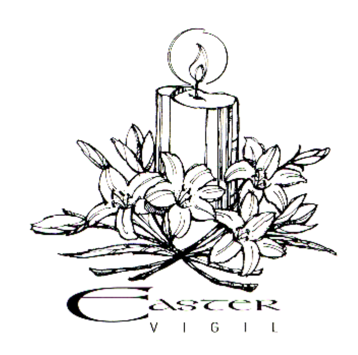
Saturday April 3, 2021 7:00PM